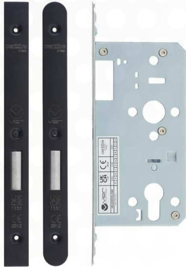
VDL0055-PCB / VDL0055-R-PCB