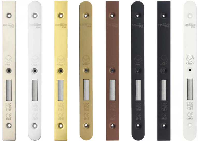
SSS PSS PVDG PVDB PVDBZ PVDBLK PCB PCW