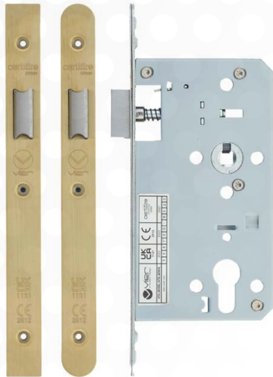
VDL0055L-PVDB / VDL0055L-R-PVDB