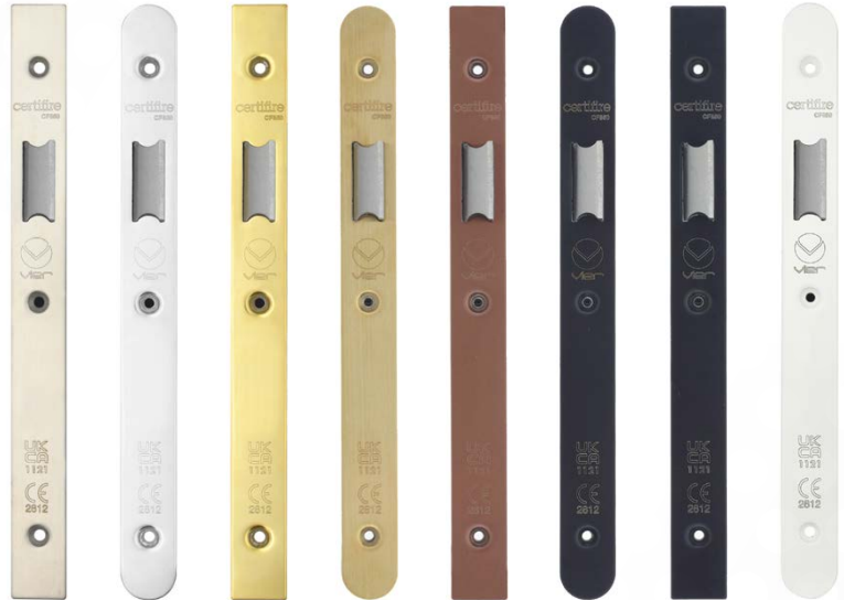
SSS PSS PVDG PVDB PVDBZ PVDBLK PCB PCW