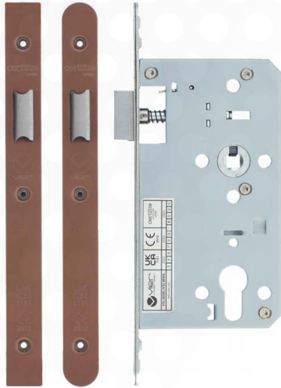
VDL0060L-PVDBZ / VDL0060L-R-PVDBZ