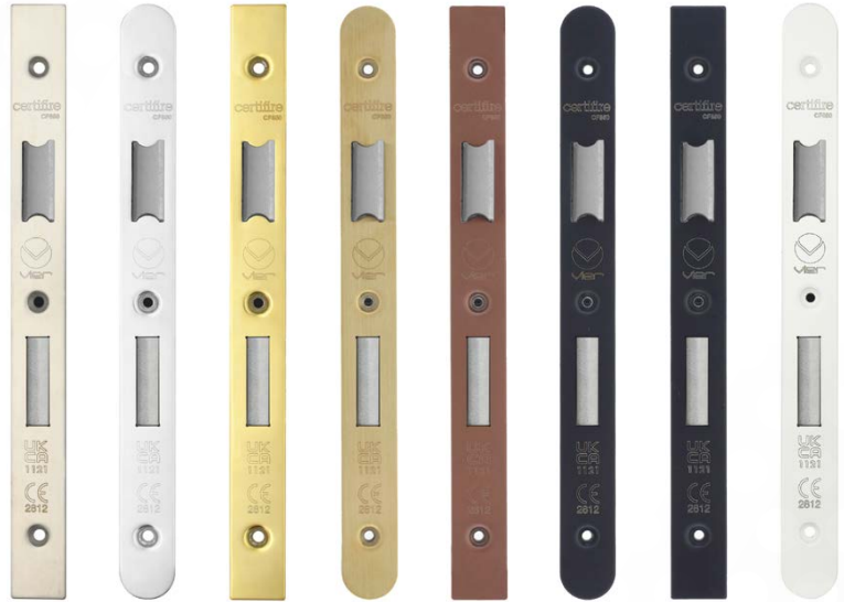
SSS PSS PVDG PVDB PVDBZ PVDBLK PCB PCW