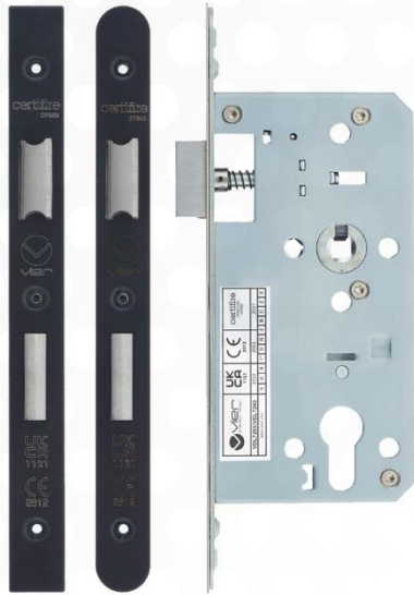
VDL7255-PVDBLK / VDL7255-R-PVDBLK